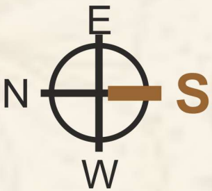
P A R K I N G P L A N